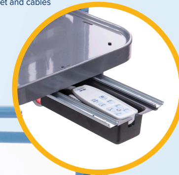
A self-locking handset box to store handset and cables out of reach