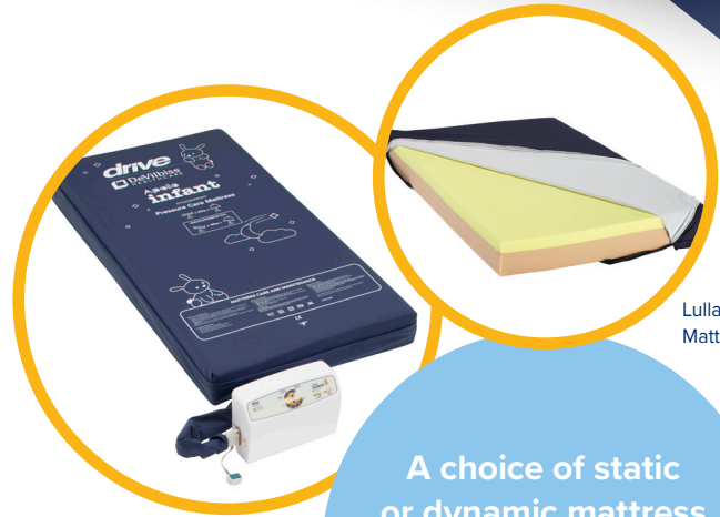
Lullaby VE Mattress