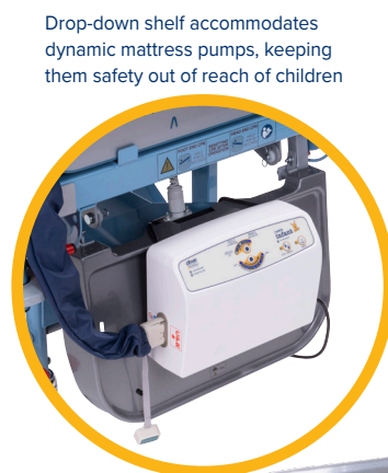
Drop-down shelf accommodates dynamic mattress pumps, keeping them safely out of reach of children