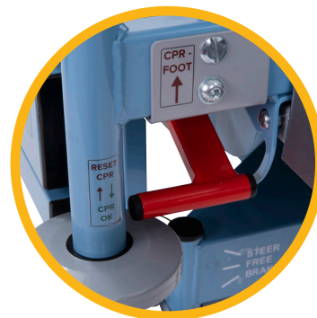
Two CPR handles at either side of the foot end of the cot will level the platform quickly in an emergency